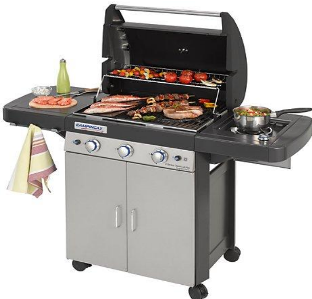
3 SERIES CLASSIC LS 3 SERIES CLASSIC LS PLUS