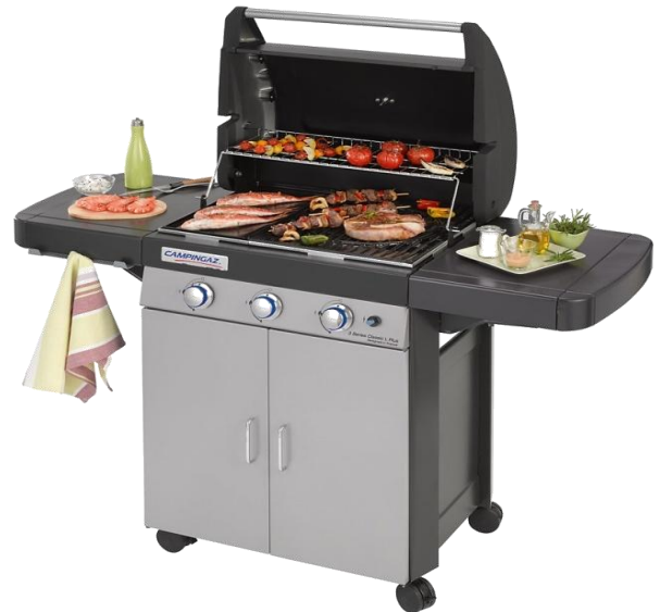
3 SERIES CLASSIC L PLUS